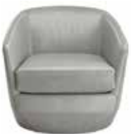
31w 35d 30h swivel chair