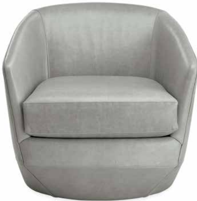
Gibbs swivel chair in Vento grey